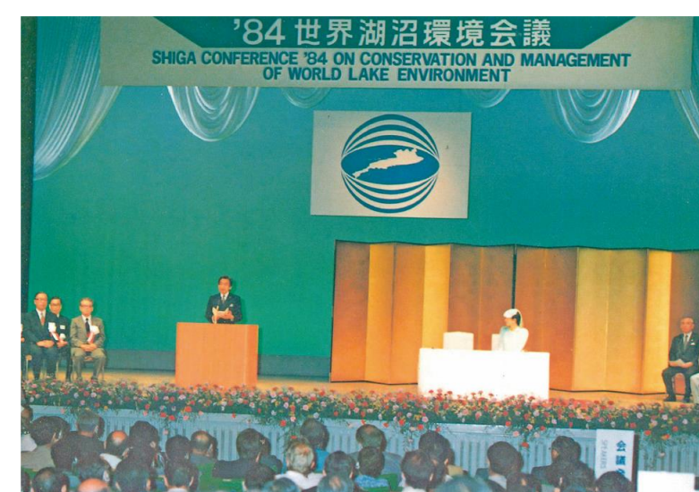
The then-Crown Prince's speech at the 1 st LECS in Otsu, Shiga in 1984