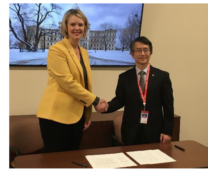
Representatives of Michigan and Shiga signing the MOU in 2020