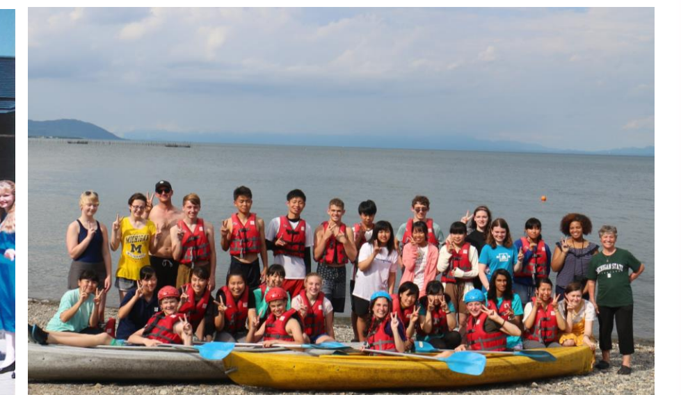
Michigan and Shiga High school students enjoying kayaking in Lake Biwa in 2017