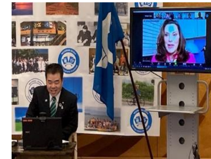
Governors discussed the impact of climate change on the lakes in 2021