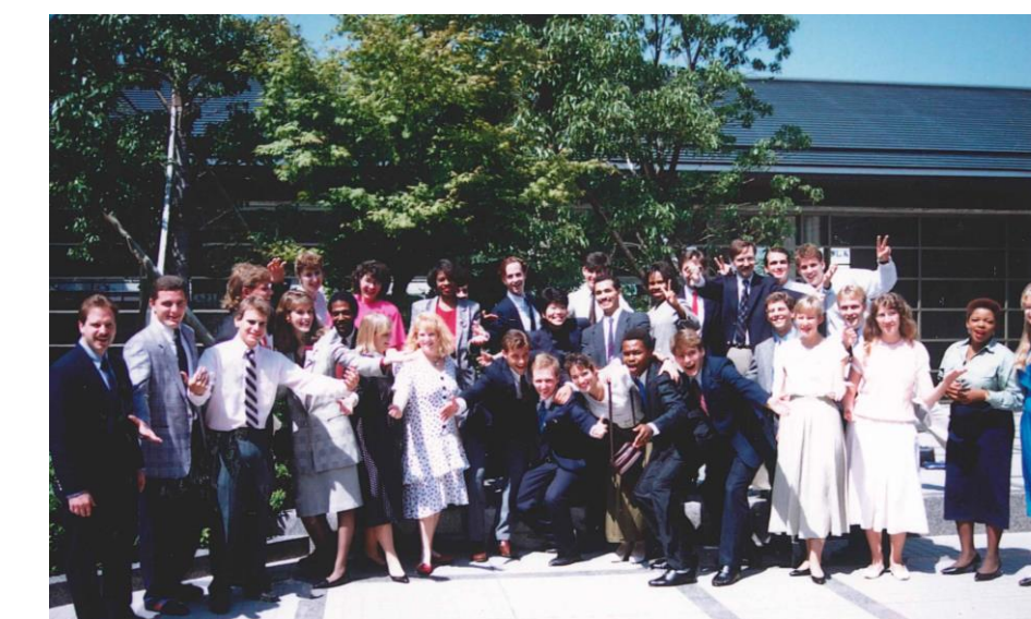
The inaugural students of Japan Center for Michigan Universities in Hikone, Shiga in 1989